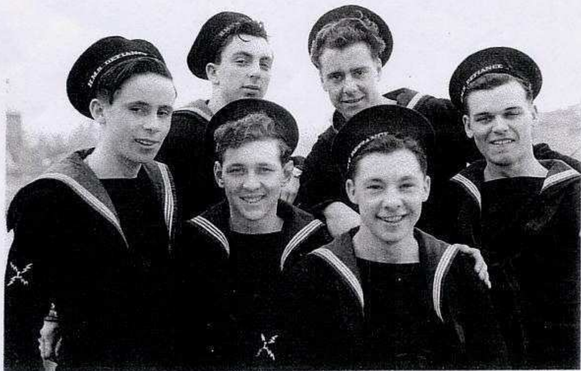
↑ H.M.S. DEPTANCE. THESE NEWPACLED P.E.M.S. 1947.