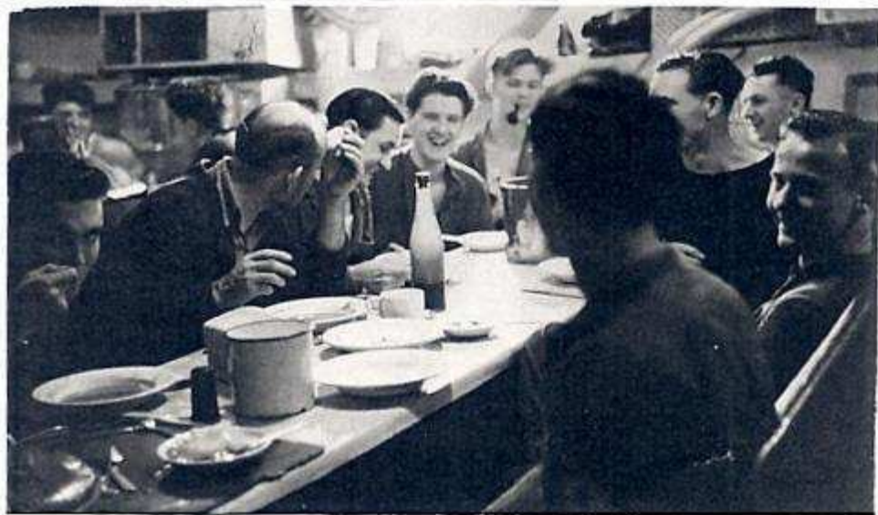
'HANDS TO DINNER' 21 MESS. THE RUM FANNY IS JUST VISIBLE AT THE FAR END OF THE MESS TABLE.